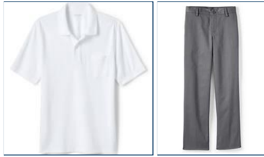
Young Men's Uniforms: School Uniform Kids Mesh Polo, School Uniform Boys Long Sleeve Oxford Dress Shirt & Boys Iron Knee Blend Plain Front Chino Pants in Gray